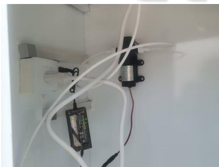
- Water Pump -