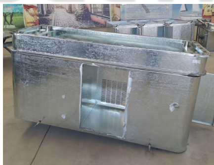
- Cart Body -