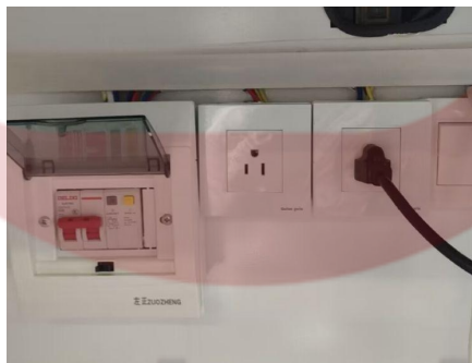
- Sockets -