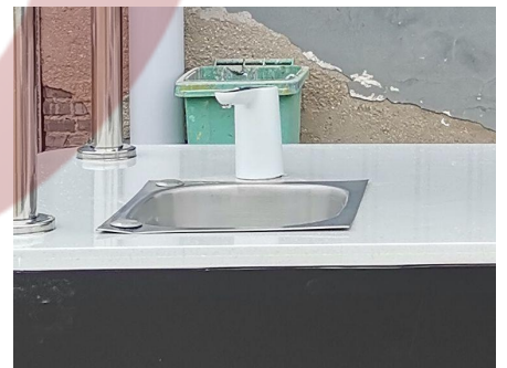
- Sink -