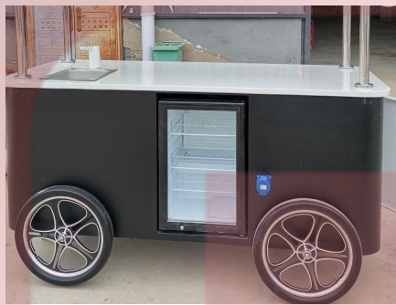
- Fridge -