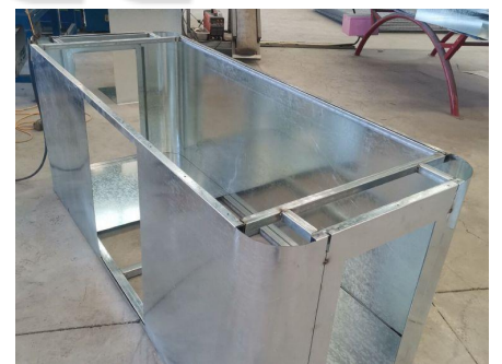
- Frame -