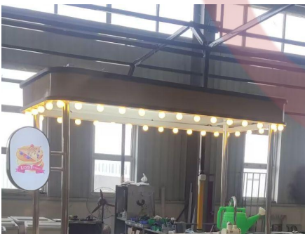
- Lights -