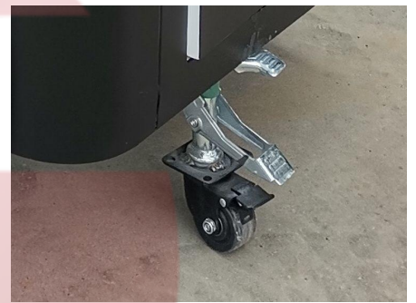
- Caster -